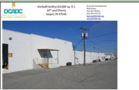
Kimball Facility (14,000 sq. ft.) 14th and Cherry Jasper, IN 47546